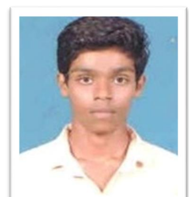
JAYA SURYA V Foxconn Technology Group NVH KoreaCompany. Ltd